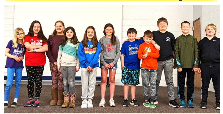
The 4th graders helped us recite Luke 24:1-12.