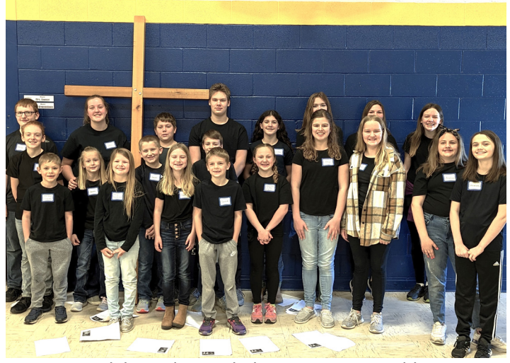
We celebrated Jesus being our Rescuer with an Easter reader's theater performed by kids from grades 1-8.