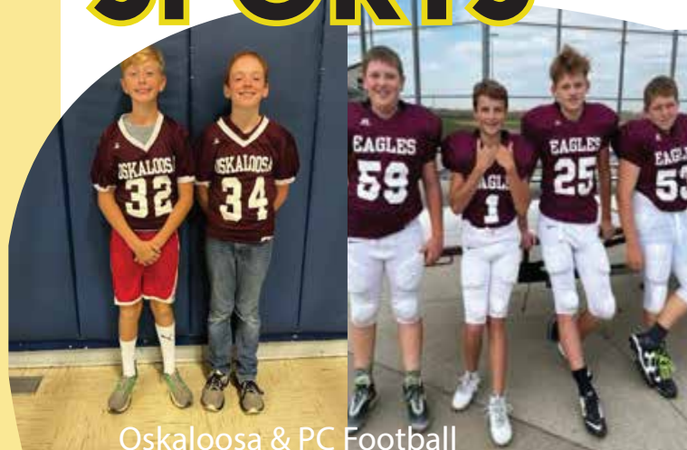
Oskaloosa & PC Football