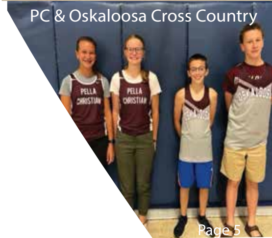
PC & Oskaloosa Cross Country