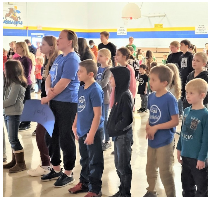
Praise and Worship December 3, 2021

LOG-STO Mission Statement: Legacy of Grace STO desires to build God's Kingdom through Christian Education. Our dedicated purpose is to collect and distribute available funds in order to extend mercy to those who struggle or are unable to afford a Christian Education for their children. This is in harmony with God's will for our lives. In Micah 6:8, God tells us "to act justly and to love mercy and walk humbly with your God."