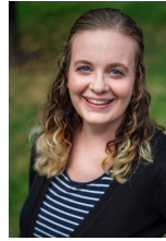
Cassi Fitzpatrick TK-8 Library, Art